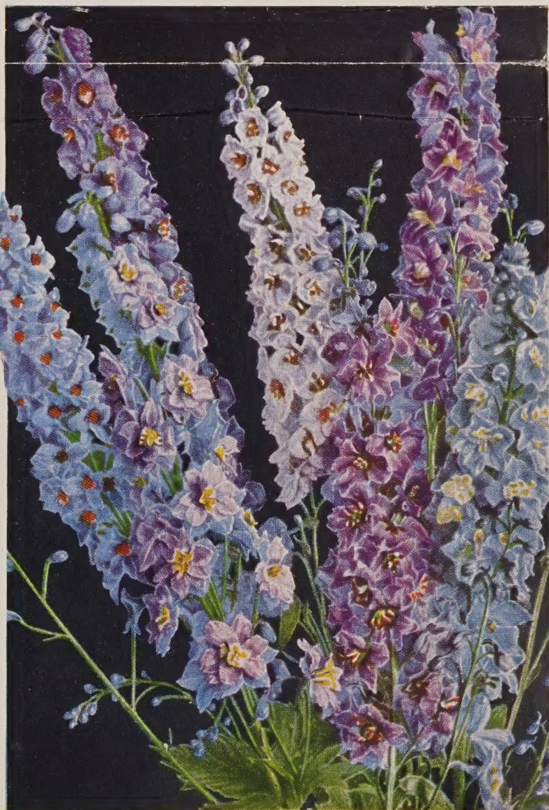
Delphinium, Pacific Coast Hybrids

PACIFIC COAST HYBRIDS. All prize-winners, our mixture contains all choice color combinations. 4 to 6 feet high. Strong, field-grown clumps, $1.15 each; $9.50 for 10.